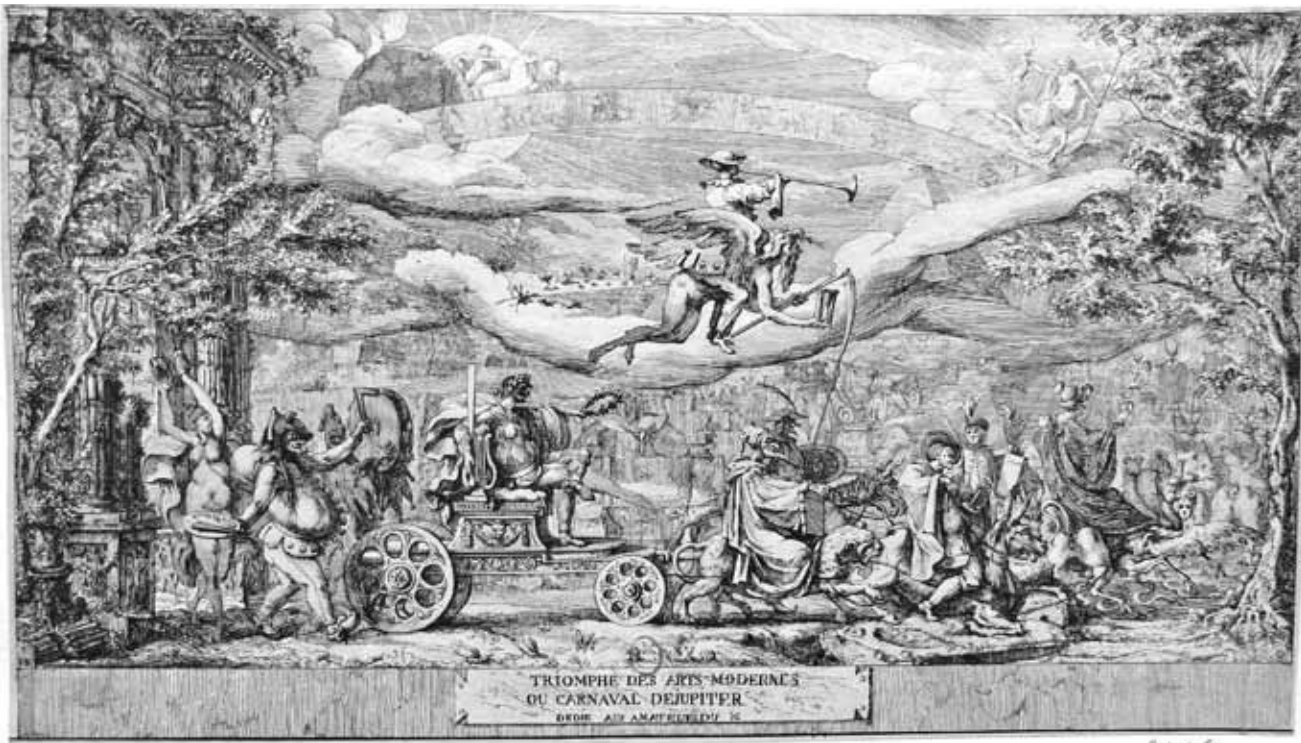
Figure 1. Anonymous, Triomphe des Arts Modernes , ca. 1700. Etching and engraving, 34.5 × 19.6 cm. Bibliothèque nationale de France (BnF), Paris.

it that tentatively date it to around 1700. A bit of digging reveals our anonymous annotator's dating motivations. On 16 May 1700, the librettist Antoine Houdar de la Motte staged a performance of his opéra-ballet , Le Triomphe des arts , and three years later, a comédie-ballet entitled Le Carnaval & la Folie was presented with Jupiter as the lead character. Both performances took up a strong modernist stance within the ongoing Quarrel of the Ancients and the Moderns that raged across France's national academies during this period; and both modernized the classic lyrical form and the heroic genre by weaving a set of mythological characters into carnivalesque festivities, emphasizing dance and galanterie throughout. Houdar's subversive cultural gesture is complemented by a political one: both plays argue for the independence of the arts from royal patronage and contradict Jean-Baptiste Lully's deferential court ballets from fifty years prior, in particular his Ballet des Arts (1663). 7