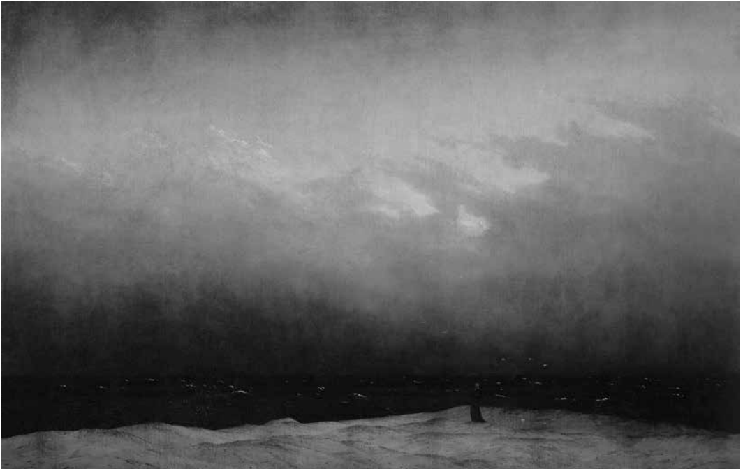
Figure 2. Caspar David Friedrich, Monk by the Sea , 1808–10. Oil on canvas, 110 × 171.5 cm. Nationalgalerie, Staatliche Museen, Berlin.