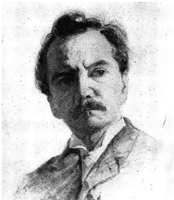
FIGURE 145. Samuel Joseph Bloom Varley , ca. 1912. Charcoal on paper, 38.1 × 37.0 cm., Ottawa, National Gallery of Canada. Reproduced courtesy of F. H. Varley Estate, Mrs. Donald McKay (Photo: National Gallery of Canada).