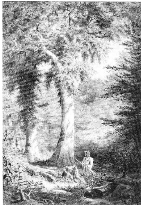
FIGURE 86. Lucius O'Brien, Lords of the Forest , 1874. Watercolour on paper, 67.2 × 46.6 cm. Art Gallery of Ontario, Toronto, The Bert and Barbara Stitt Family Collection, The Bert and Barbara Stitt Family Collection.