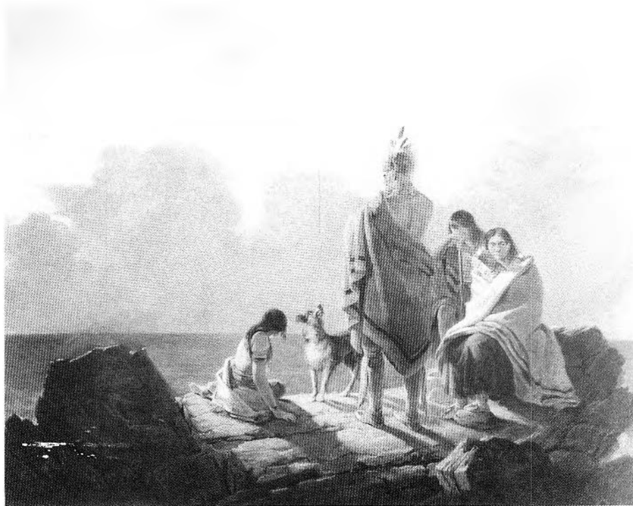
FIGURE 87. Tompkins H. Matteson, The Last of the Race , 1874. Oil on canvas, 100.9 × 127 cm. (Photo: Courtesy of the New York Historical Society, New York City).