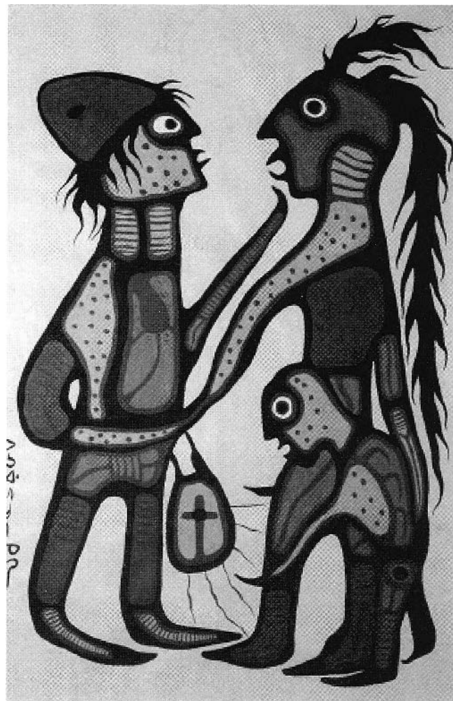
Figure 2. Norval Morrisseau, The Gift , 1975. Acrylic on kraft paper, 196 × 122 cm. Thunder Bay, Thunder Bay Art Gallery, Helen E. Band Collection (Photo: courtesy of Thunder Bay Art Gallery).

artist fundamentally shifted the power dynamic that he was exploring in his art. Maintaining a similar earthy colour palette, Morrisseau in The Gift again employs green and red to exhibit areas of the heart and the brain as juxtaposed focal points and world views. However, the body politics of the two forms changes to further elucidate the contested space of hybridity.