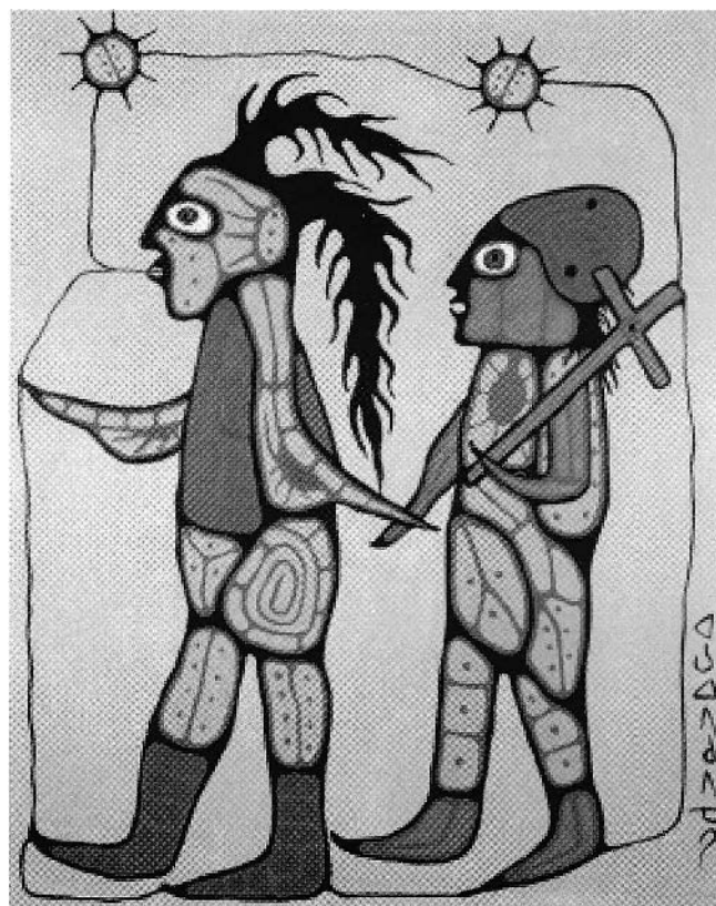
Figure 1. Norval Morrisseau, White Man’s Curse , 1969. Acrylic on canvas, 127 × 101.6 cm. Regina, MacKenzie Art Gallery.

tion about seven prophets who forecast disaster if the people did not leave the Atlantic coastal region. 28 The westward migration undertaken by the Anishnaabe was documented in birchbark scrolls.