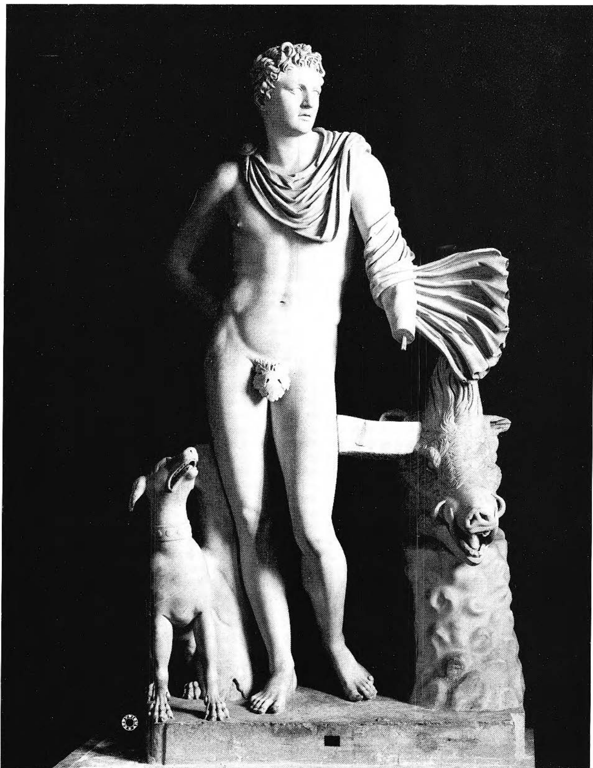
FIGURE 1. Meleager . Rome, Vatican Museum.