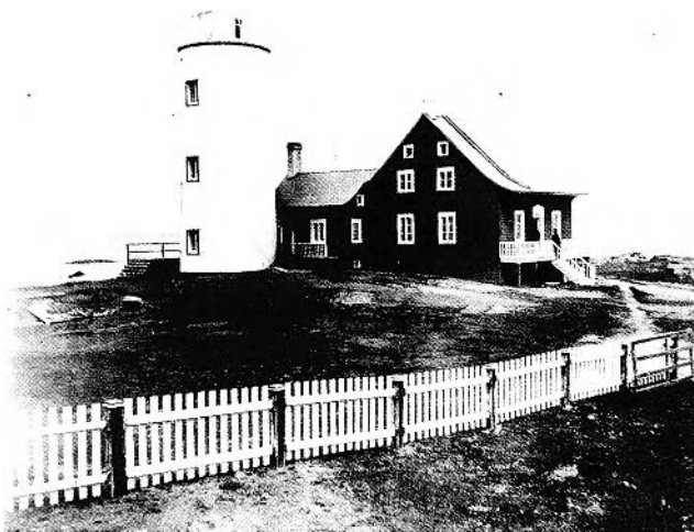
FIGURE 3. Lighthouse, Green Island, Quebec, 1809 (Photo: Public Archives of Canada).