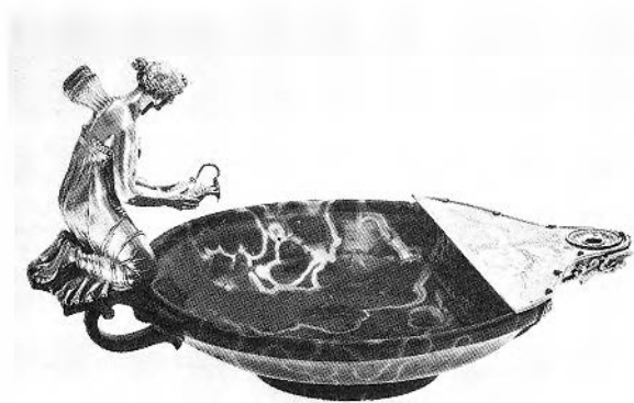
FIGURE 1. Late Roman agate bowl with Early Christian incised vine and French Empire mounts. Ottawa, National Gallery of Canada.

An Agate Roman Tazza from the J.P. Morgan Collection in the National Gallery of Canada was discussed (in absentia) by Philippe Verdier, Université de Montréal. The paper examined successive transformations of the cup (Fig. 1). It was given a Christian overlay of