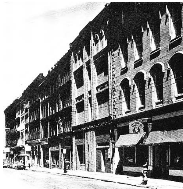
FIGURE 4. William Thomas and Sons and others, Buildings on north side of Granville Street, Halifax, 1859 ff.