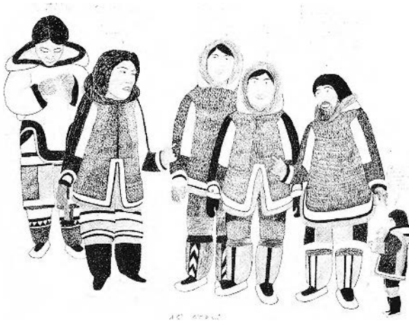
FIGURE 3. Peter Pitseolak. Untitled (reconstruction of past family event). Graphite, coloured pencil, and felt pen on paper, 50.7 × 65.5 cm. Cape Dorset (Baffin Island), West Baffin Eskimo Co-operative.

watercolours were Inuit figures with magazine photograph faces pasted on in a most amusing way; in both media, repetitiveness became a hallmark, not because Pitseolak was lazy, but because, uninfluenced by our notions of artistic creativity, he believed that if he 'got it right' in one composition, the same image would serve in the next.