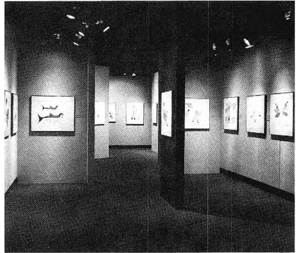
FIGURE 1. Peter Pitseolak . Installation view of the graphics section.

graphy formed a background to and provides images of his graphic design.