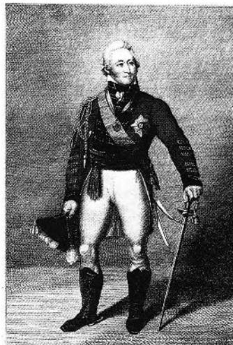
L' GENL SIR JOHN COAPE SHERBROOKE G.C.B.