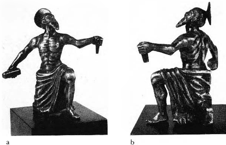
FIGURE 1. a) Bronze statuette of St. Jerome, hollow cast, traces of black lacquer; H. 14,5 cm. Italian, early 16th century; here attributed to the Workshop of Severo da Ravenna.