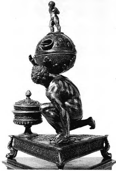
FIGURE 6. a) Atlas Supporting the Globe of Heaven, bronze, hollow cast, H. 34.6 cm. Normally attributed to the Workshop of Riccio, but possibly connected to the Workshop of Severo da Ravenna. The Frick Collection, New York, Inv. 15.2.24.

R.O.M.'s figure is more comfortably accommodated among those bronzes which are now generally, though as yet by no means conclusively, grouped around Severo di Ravenna. It is possible of course that some works among them may be related to a distinguishable if anonymous workshop hand. It is interesting in this light to be aware of some similarities apparent between the St. Jerome and a group of Atlas figures supporting the globe of heaven, which, although considered to derive from a Riccio model, could equally well have been cast in another workshop. 16 The tension in the pectoralis major muscles of the Atlas figures, as well as the ridge-like stylisations of the latissimus dorsi muscles find an echo in the coarser musculature of the torso of the St. Jerome . The protruding eyeballs of the Atlas bronzes, the stylisation of anatomical features within the arms, hands, chest and back are all perhaps as close to bronzes now attributed to the Severo workshop as to Riccio's. This is seen in the details of the Frick Atlas (Fig. 6 a-b) whose stand, for example, has ornamental details of the same form and style as those associated with writing caskets, such as that in the Cleveland Museum of Art, now attributed to Severo. 17 What is equally important is that the lid of the urn on the base of the Frick piece is of the same type as that appearing with the Museo