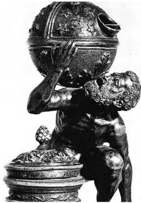
FIGURE 6. b) Atlas Supporting the Globe of Heaven (Detail of Figure 6 a).

R.O.M.'s figure is more comfortably accommodated among those bronzes which are now generally, though as yet by no means conclusively, grouped around Severo di Ravenna. It is possible of course that some works among them may be related to a distinguishable if anonymous workshop hand. It is interesting in this light to be aware of some similarities apparent between the St. Jerome and a group of Atlas figures supporting the globe of heaven, which, although considered to derive from a Riccio model, could equally well have been cast in another workshop. 16 The tension in the pectoralis major muscles of the Atlas figures, as well as the ridge-like stylisations of the latissimus dorsi muscles find an echo in the coarser musculature of the torso of the St. Jerome . The protruding eyeballs of the Atlas bronzes, the stylisation of anatomical features within the arms, hands, chest and back are all perhaps as close to bronzes now attributed to the Severo workshop as to Riccio's. This is seen in the details of the Frick Atlas (Fig. 6 a-b) whose stand, for example, has ornamental details of the same form and style as those associated with writing caskets, such as that in the Cleveland Museum of Art, now attributed to Severo. 17 What is equally important is that the lid of the urn on the base of the Frick piece is of the same type as that appearing with the Museo