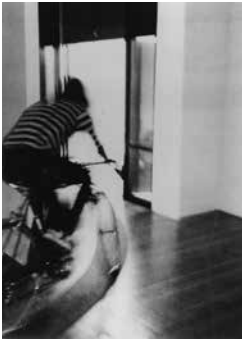
Figure 6. Chris Burden, Bicycle Piece, May 6–20, 1971. Performance, Art Gallery, University of California, Irvine. © 2017 Chris Burden; licensed by the Chris Burden Estate and Artists Rights Society (ARS), New York.

including Shoot (1971), and it was a radical DIY space that garnered significant, regional attention. What needed to be taken care of the week Burden was in the locker was the scheduling of gallery attendants for upcoming shows and, in particular, the creation of a better system and chain of responsibility for keeping the space open. They also discussed a change in the management of the building, rising rents, and the feasibility of staying there after they graduated. While Burden was in the locker, he also entertained a reporter from the Los Angeles Times , who interviewed him and his classmates for a feature article on F Space that ended up being as much about Burden and Five Day Locker Piece as it was about the gallery. 26