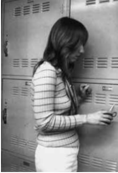
Figure 4 (top). Chris Burden, Announcement for Five Day Locker Piece , 1971. Xerox, 35.5 × 21.5 cm. © 2017 Chris Burden; licensed by the Chris Burden Estate and Artists Rights Society (ARS), New York.