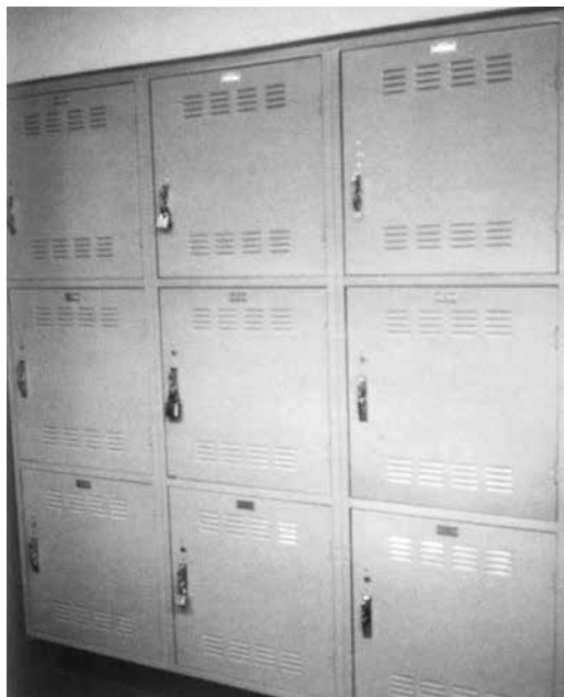
Figure 1. Chris Burden, Five Day Locker Piece, April 26–30, 1971. Performance/sculpture, University of California, Irvine.