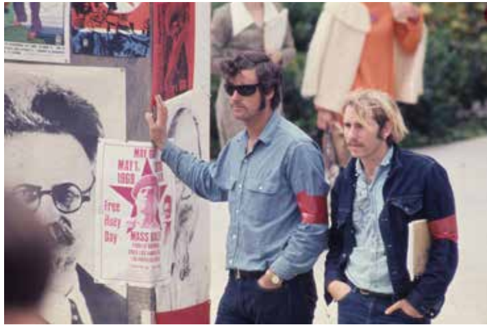
Figure 7. May Day protest on Gateway Plaza at the University of California, Irvine in 1969.