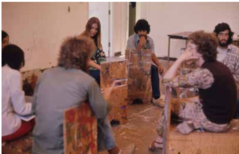
Figure 3. Promotional photo for the University of California, Irvine, showing students in art class—one of whom appears to be meditating—using their meager studio equipment as furniture to hold a discussion.

cannot work in a vacuum: he is dependent upon a community for concepts, conversation, and communication. The atmosphere of the university provides the developing artist an ideal opportunity to live sensitively in the midst of accessible resources in a climate that is constantly vibrating with life and challenging our sensibilities. 16