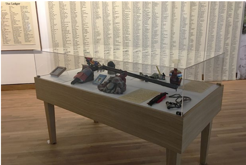
Figure 6. Here We Are Here: Black Canadian Contemporary Art , installation view, Royal Ontario Museum, Toronto, 2018.