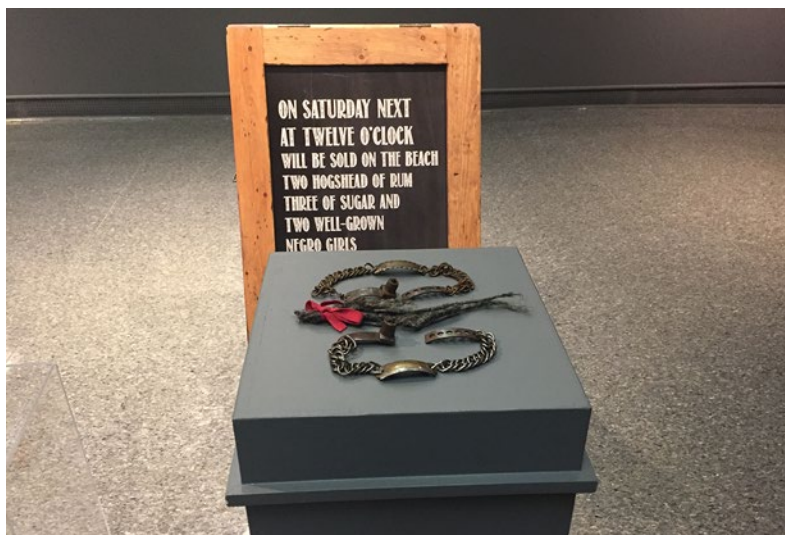
Figure 4. Excavation: Memory Work, installation view, UNB ART Centre, Fredericton, New Brunswick, 2018.

tan-coloured paper were shedding from the cover. Remembering Shannon's precise instructions, I placed a gloved finger along the pages, not sure where to open it, measured half finger or so, to first knuckle.