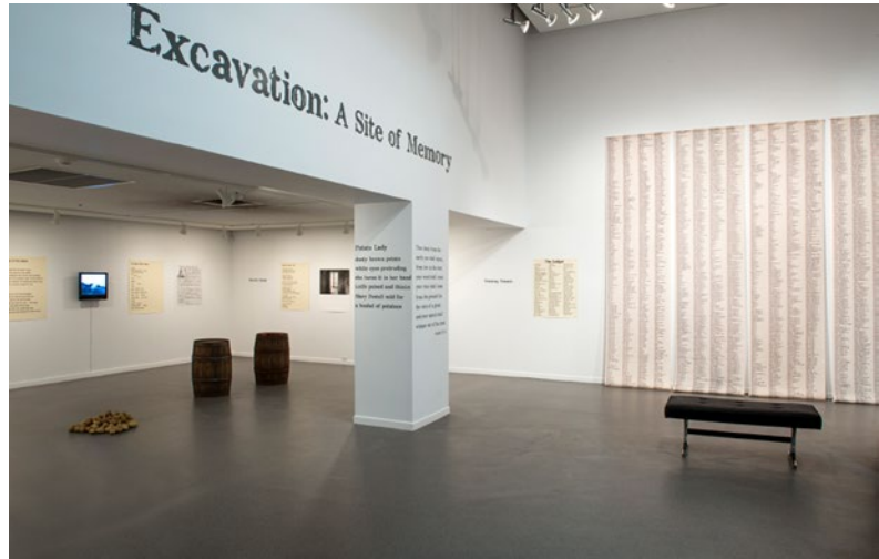
Figure 1. Excavation: A Site of Memory , installation view, Dalhousie Art Gallery, Halifax, Nova Scotia, 2013.

archives. I have uncoupled my archival findings (textual and visual records and material objects) from the physical, limited structure of the archive, for repurposing.