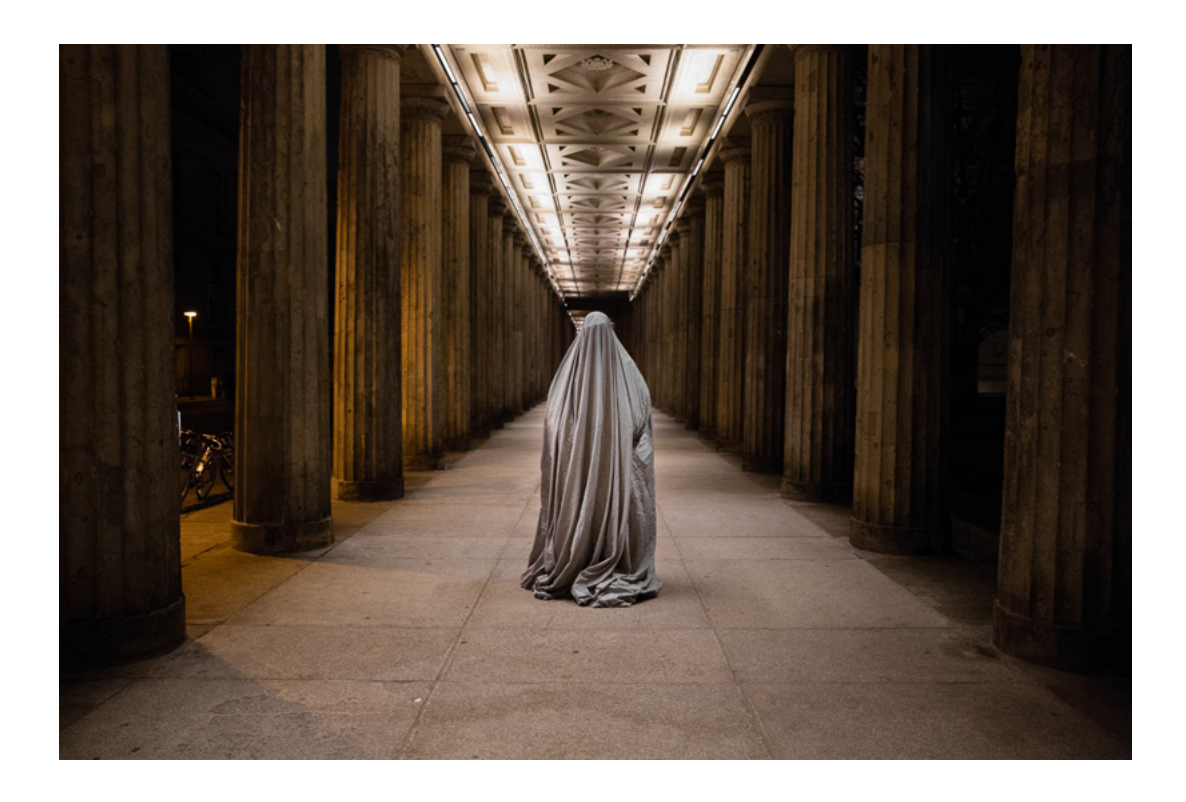
Figure 1. Regina José Galindo, Aparición, Owned by Others, Berlin, 2021.